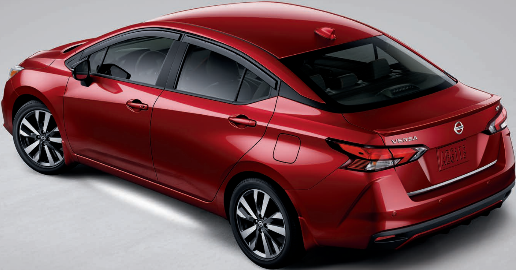
Nissan Versa® SR shown in Scarlet Ember with Chrome Trunk Accent, Exterior Ground Lighting, Side-Window Deflectors, Rear Spoiler (standard on SR), and Splash Guards.

Every Genuine Nissan Accessory is custom-fit, custom-designed and durability-tested. Each one is backed by Nissan's 3-year/60,000-km (whichever occurs first) limited warranty (if installed by dealer at the time of purchase), and can be financed when installed by dealer at time of purchase. Terms, conditions, and exclusions apply. See your Warranty Information Booklet for complete details.